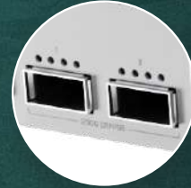
2x 200G QSFP56