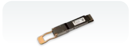
DDQ+85MP01D 400G 100 m optical transceiver

With CRS812, 400 Gigabits is no longer out of reach – it's an affordable way to launch your network into the future, while keeping your existing gear in the loop!