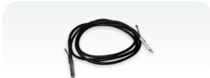
DDQ+DA00031 400G DAC, 3 m