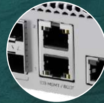
2x 1G/10G Ethernet ports

The CRS812 scales your network from 10 to 400G in one simple, affordable, yet managed RouterOS v7 box – no forklift upgrades needed!