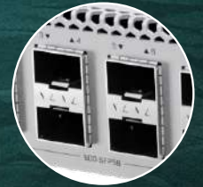
8x 50G SFP56 ports