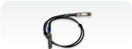
DDQ+DA0001 400G DAC, 1 m