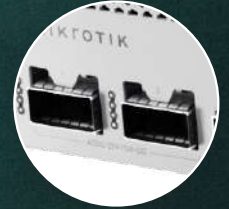
2x 400G QSFP56-DD ports